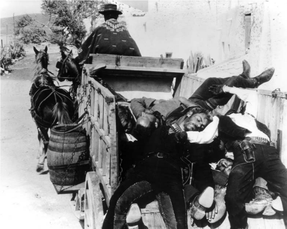
A closing sequence from For a Few Dollars More .

Leone's technical devices are frequently deliberately overplayed. He uses fluid camera movements, often incorporating the camera as part of the action. He places objects in eccentric juxtapositions and frequently uses big close-ups to show reaction rather than action.