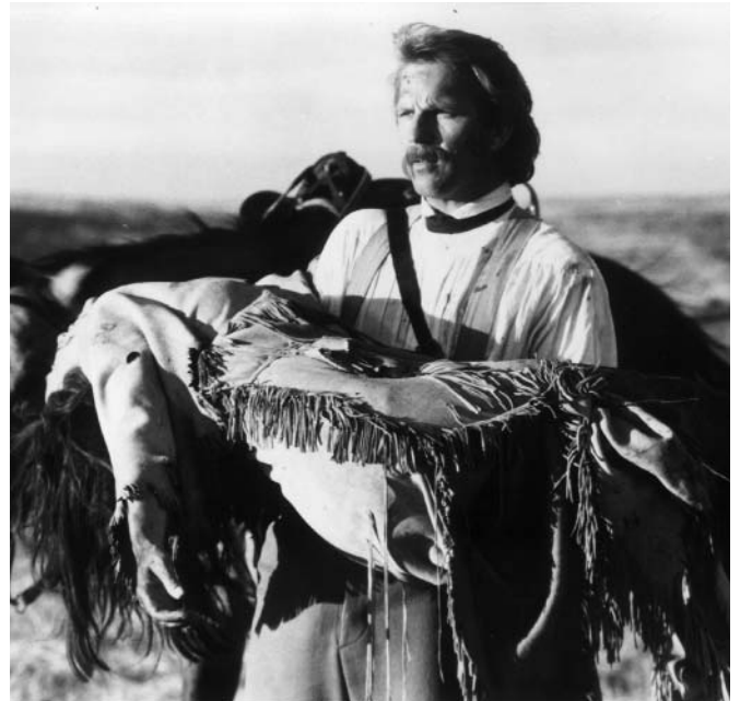
Kevin Costner in Dances with Wolves