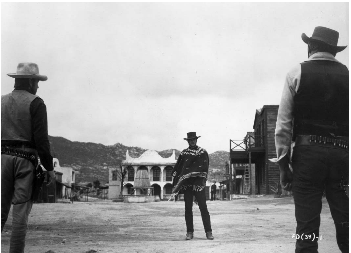
A characteristic scene from Sergio Leone's A Fistful of Dollars .

In 1958, 54 feature Westerns were made in Hollywood: in 1962-3 a mere eleven. However, in 1967 annual production reached 37. Between the summer of 1963 and April 1964 the month Leone began filming A Fistful of Dollars – 24 Spaghetti Westerns were made and by 1967 annual production of Spaghetti Westerns had risen to 72. It is clear that the revival of the Hollywood Western was largely due to the success of 'international Westerns', especially the Spaghetti Western, and even more importantly the films of Sergio Leone starring Clint Eastwood. The popularity of Leone's Westerns not only boosted commercial demand but also influenced the content and style of future Hollywood Westerns.