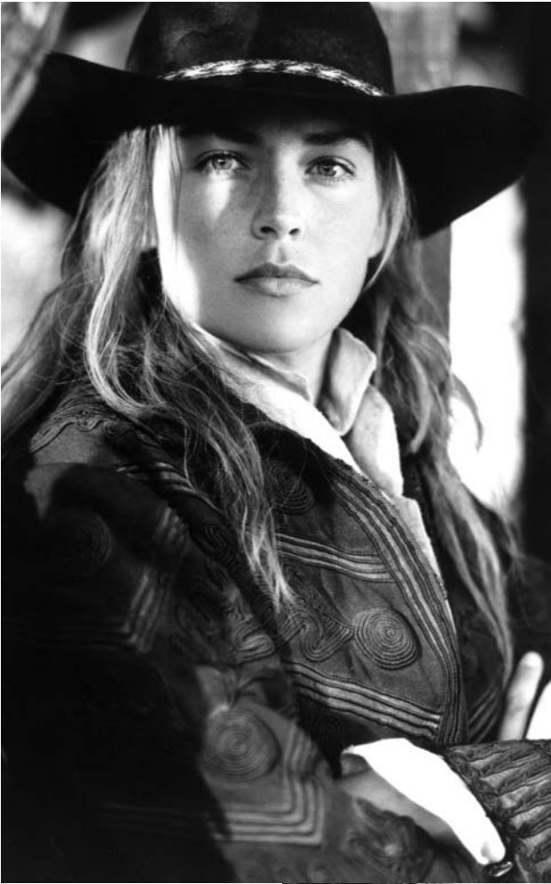
Sharon Stone – a vengeful woman in The Quick and the Dead