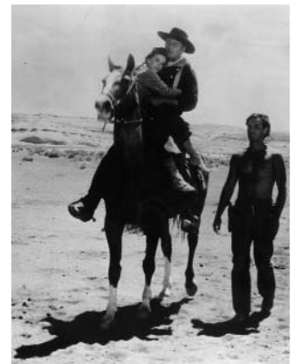
The Searchers : Ethan Edwards (John Wayne) returns his niece to civilisation.

In My Darling Clementine (1946) and The Man Who Shot Liberty Valance (1962), Ford has double heroes. The film praises the rough-hewn yet noble heroes who made the settlement of the west possible, but they remain incapable of belonging to the civilised world whose path they have cleared. This figure is symbolised in The Man Who Shot Liberty Valance by the cactus rose, a flower that only blooms in the desert.