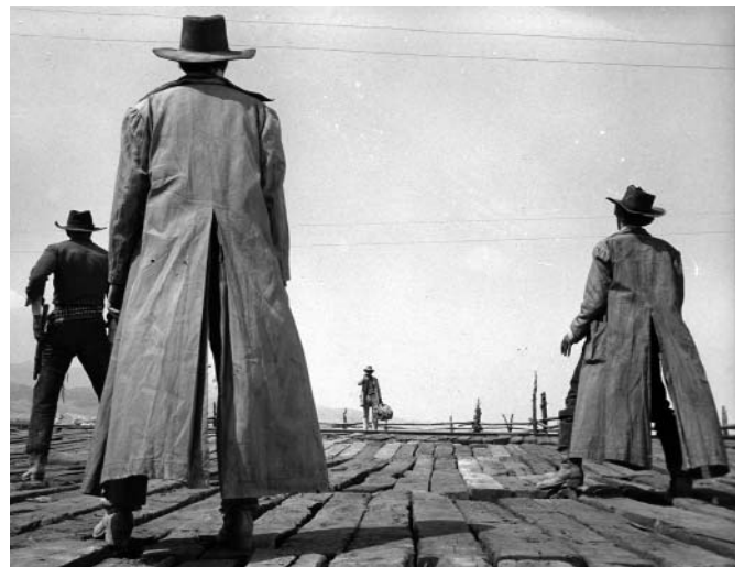
Themes of death in Leone's Once Upon a Time in the West .

The character of Jill McBain is central to an understanding of the film. If Leone's world is essentially womanless, Once Upon a Time in the West is the exception that proves the rule. It is not that women are handled badly or indifferently in his films it is just that they hardly exist at all. Jill McBain is different. The scene where she strips off her city clothes to draw water from the well combines two essential motifs in the film. The 'mother' figure and the sense of hope for the future. Jill becomes the matriarch to the railroad gangs. Harmonica says, 'It's going to be a beautiful town, Sweetwater', and it is Jill who will make it so. Within the one character lives a succession of Western stereotypes. She has been described as the adoring wife, a whore, a mother, a victim of rape and a matriarch. It is an irony that for all Leone's supposed misogyny it is she who survives to give hope for the future.