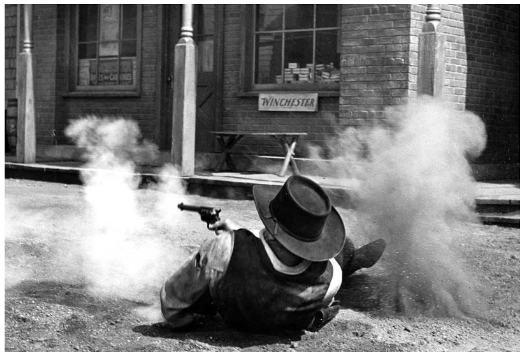
Will Kane (Gary Cooper) fighting for his life and honour in High Noon .