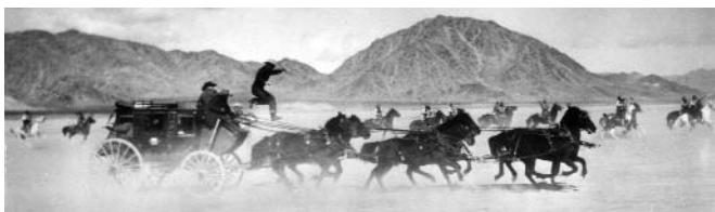
The archetypal Western moment in Stagecoach : fleeing from the Indians.

The characters in Stagecoach represent an almost perfect cross-section of Western types. We are introduced to the 'proper' heroine in the person of the cavalry officer's pregnant wife; the 'fallen' woman in the person of the banished saloon girl; the chivalrous Southern gambler; the big-hearted alcoholic doctor; the comic salesman; the bluff, jolly uncomplicated driver; the gruff, sterling, honest sheriff; the good outlaw seeking an honest start; all with the Seventh Cavalry and marauding Indians.