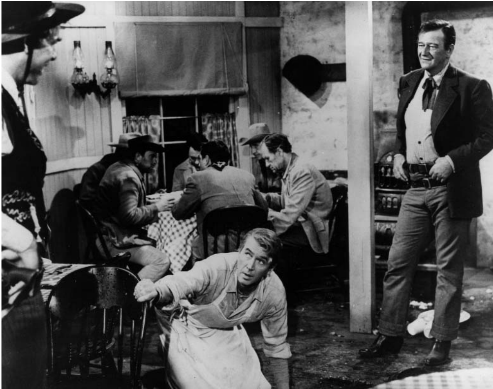
From The Man Who Shot Liberty Valance : the archetypal Western hero (John Wayne) meets the ineffectual Eastern politician (James Stewart).