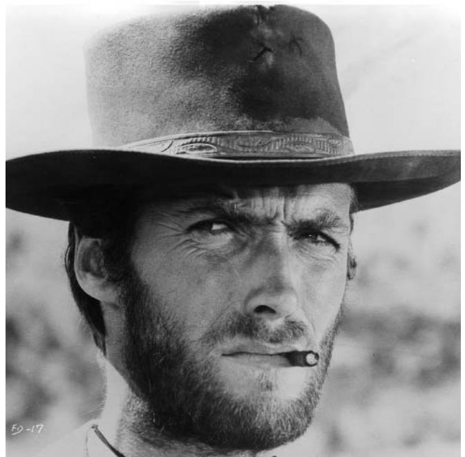
Clint Eastwood's 'the man with no name' – another kind of hero?

Clint Eastwood was aware of the differences between his acting style and what he referred to as the 'Helzapoppin school of drama' in Italy. He decided to remain 'impassive'. Also, according to Eastwood, the original script of A Fistful of Dollars was overlong and very wordy. As shooting progressed Eastwood and Leone came to a compromise over the dialogue and Eastwood's character was allowed to say less and less.